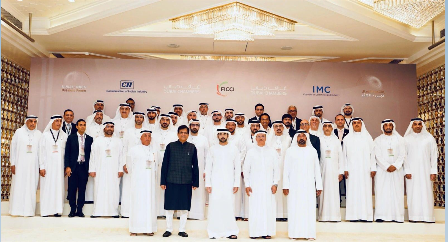
April 8, 2025: His Highness Sheikh Hamdan bin Mohammed bin Rashid Al Maktoum, Crown Prince of Dubai accompanied by several ministers, senior government officials, and business leaders with India's Union Minister of Commerce and Industry, Shri Piyush Goyal in Mumbai.

Coinciding with the Crown Prince of Dubai's visit, members of the UAE-India Business Council (UIBC) participated in the engagement